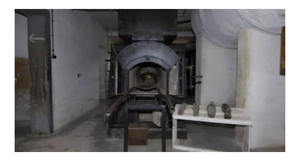
There, I recommend them not to follow the direction of the visit, indicated by the arrow to the left, but to go behind the furnace.

Personally, I recommend to the French people to go visit the Struthof building, and more especially the crematorium building.